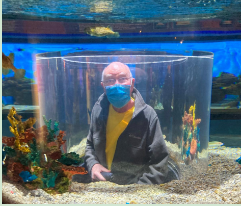
Asbury Pointe Retirement Community residents enjoyed a day at the Aquarium of Niagara. Field trips are not just for kids!