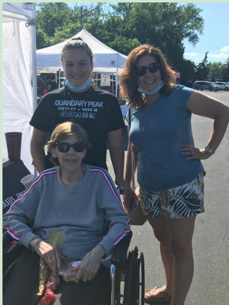
Our residents and their family members are thoroughly enjoying our weekly farmers market - sampling, sipping and buying locally produced treats like jams, juices and even wine!