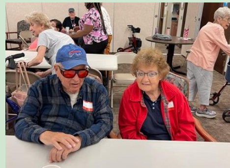
Ken-Ton Presbyterian Village residents are so happy to be able to get back together again for their coffee hour.