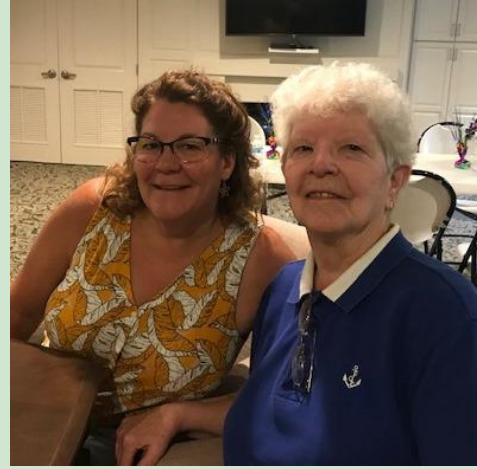
Our residents at Presbyterian Village at North Church (and their guests) kicked off the summer with a cookout and ice cream social.