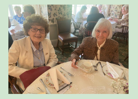
Residents at Presbyterian Village at North Church having afternoon tea at Asa Ransom House.