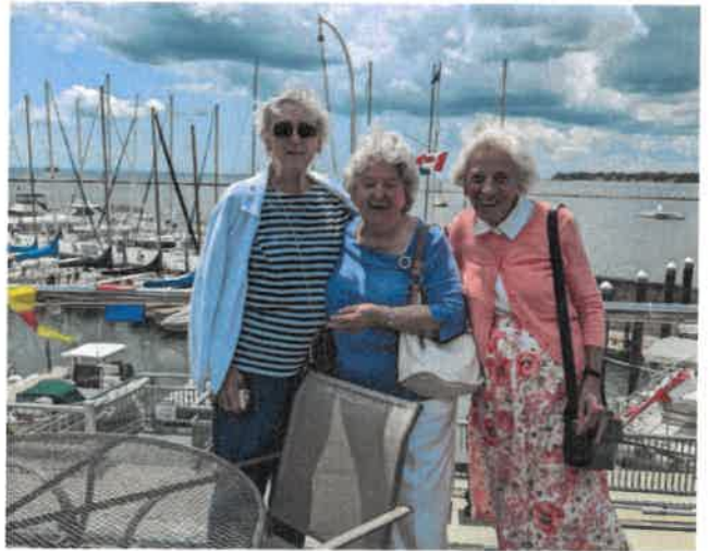
Residents at Presbyterian Village at North Church spent their summer doing activities such as playing croquet, going on fun day trips to Hidden Valley Animal Adventure and lunching at the Buffalo Yacht club.